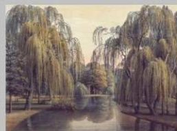
Harrachpark (Gauermann, 1810)

The park features various botanical rarities, such as weeping European hornbeams, swamp cypresses, cutleaf European beeches and an oriental plane. Branches of the Leitha River have been integrated in the layout of the park. In former times they were navigable by boat. The integration of the river arms in the design of the park is an essential element of the impressive spatial experience offered by the park.