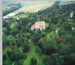
Eckartsau Palace Gardens

The special feature of this garden is the contrast between the artificially designed nature and the riparian forest surrounding it. Nearly the whole network of paths and some old specimens of trees of the original layout and design of the park have survived. Today, the palace accommodates the forest commission and is also a door to the Donauauen National Park .